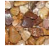
Trent Pea Gravel