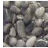
Dove Grey Pebbles