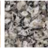
Silver Grey Granite