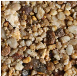
Chocolate Buff 3, 6 & 10mm