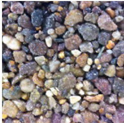
Chestnut Brown 6 & 10mm