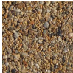
Rhine Gold 6 & 10mm