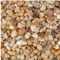
Autumn Toffee 3 & 5mm