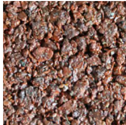
Terracotta 3 & 6mm